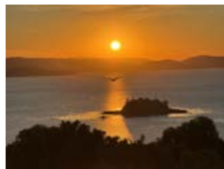
Home to Roost - Clare

The Photography Competition & Exhibition raised £507 (Income £654, Expenses £147) (2024net income: £420)