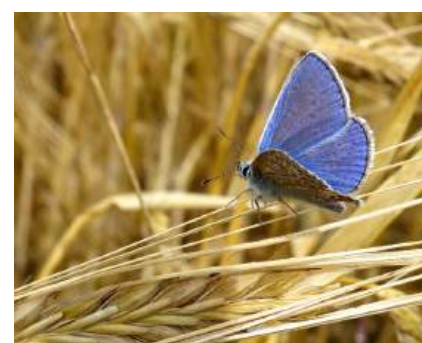
Common Blue Butterfly - Elizabeth

The Photography Competition & Exhibition raised £420 (Income £549, Expenses £129) (2023 net income: £327)