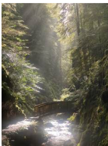
Fairy Bridge at Puck's Glen