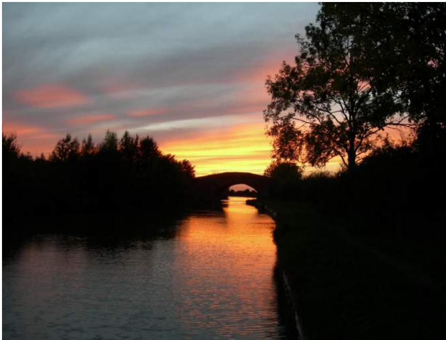
Music: The Golden Present and Spenta Mainyu by Jesse Gallagher

© 2005 Archbishops' Council published by Church House Publishing